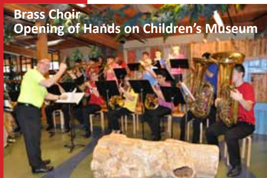
Brass Choir Opening of Hands on Children's Museum