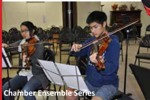
Chamber Ensemble Series